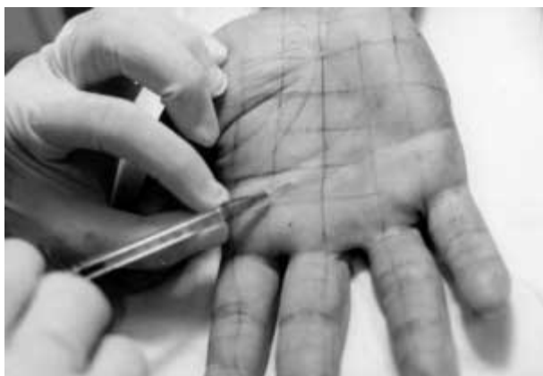
FIG. 1. — Palmar intradermal injection of Btx-A

humidity (70%) were held constant. All patients were questioned for their subjective impressions of sweat reduction and satisfaction prior to and monthly after the treatment. For sweat reduction a scale with 10% intervals (from 0% to 100%) was included in the questionnaire. Treatment satisfaction was rated as no, mild, moderate or total.