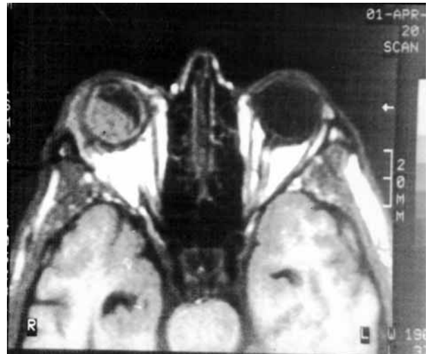
FIG. 2. — T2W axial MR section of the left eye demonstrating the metastatic intraocular tumor.

removal of metastatic brain lesion and adjuvant chemotherapy has been reported in case reports (Logothesis et al. , 1982).