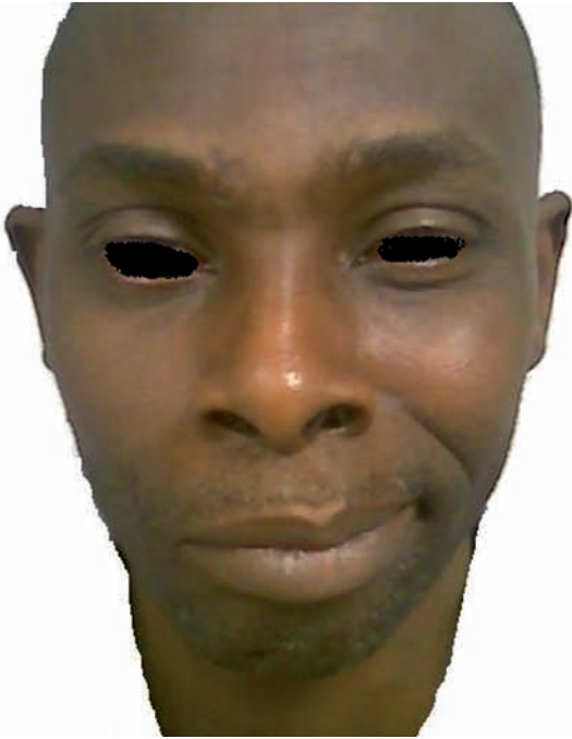
FIG. 2. — Persistent contraction of left facial muscles

most cases the myokymic discharges are only observed at the beginning of the disease on electromyographic analysis (10). A large number of other causes are mentioned in the literature, including tuberculous meningitis. We found only two cases of hyperexcitability of the facial nerve related to tuberculosis: tuberculoma of the pons with FM and facial weakness (11) and hemifacial spasm in tuberculous meningitis (12). It should be noted that, unlike the reported cases, in which FM was associated with facial palsy, our patient did not show this sign.